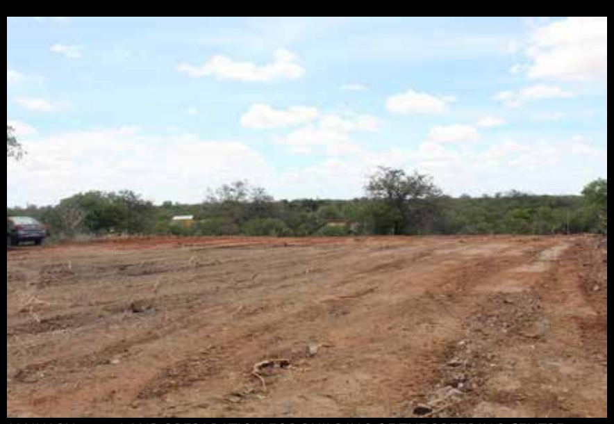
JANUARY 2019: LAND PREPARATION FOR BUILDING OF THE BREEDING CENTRE