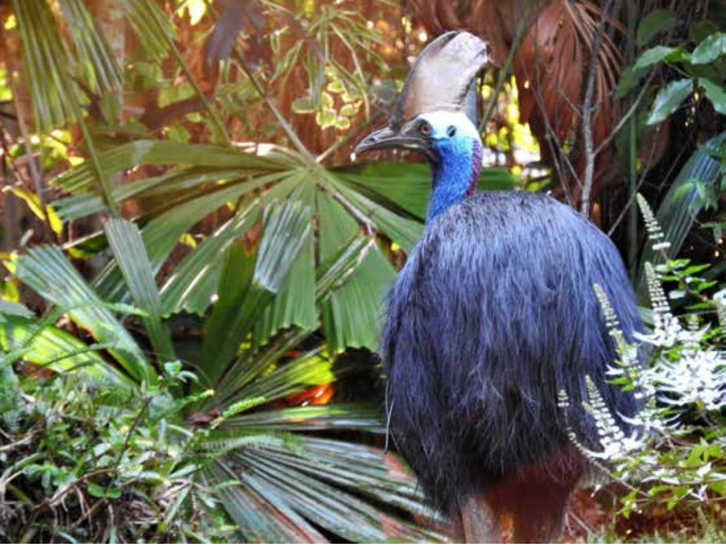
SOUTHERN CASSOWARY OR DOUBLE-WATTLED CASSOWARY (CASUARIUS CASUARIUS) PHOTO VISITING CASSOWARIES