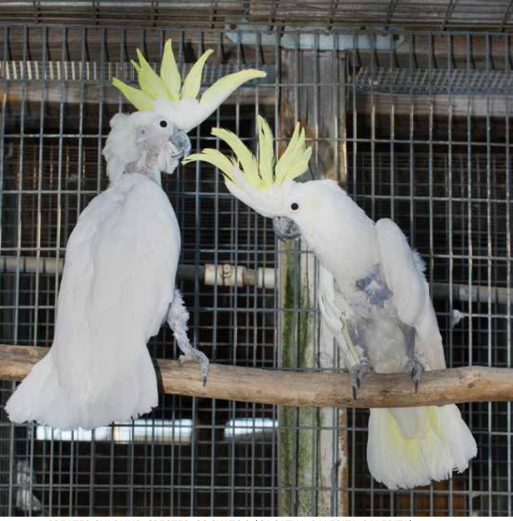
GREATER SULPHUR-CRESTED COCKATOO (CACATUA GALERITA GALERITA)

and it has the opportunity to bathe each time it rains.