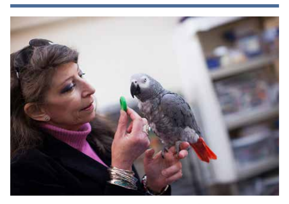
Study shows parrots can pass classic test of intelligence

We will send regular updates over the coming weeks and months showing the progress of the Spix's macaw Conservation/Release Complex. With the current progress and weather permitting we expect the facilities to be ready to receive Spix's macaws around the middle of Brazil's winter this year.