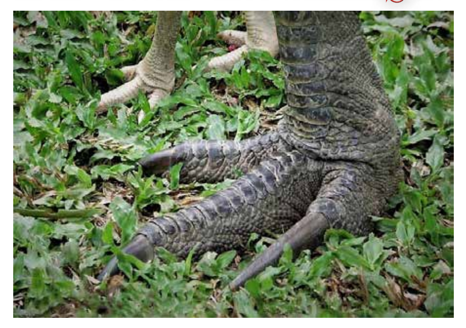
Stumped? See answer on page 44