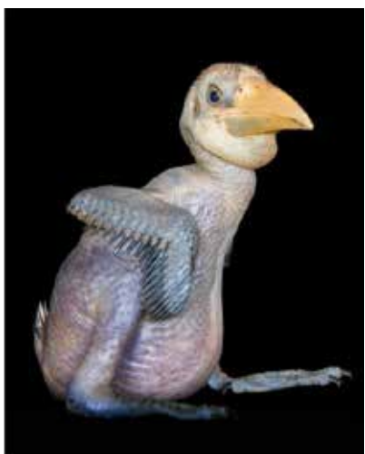
Papuan hornbill ( Rhyticeros plicatus ) male, three weeks, Photo: Lisa Marun

While adult females are smaller than males, the truly distinguishing feature between the genders is that males' neck feathers, rather than being black, are a rufous color.