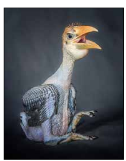
Papuan hornbill ( Rhyticeros plicatus ) male, aged six weeks.