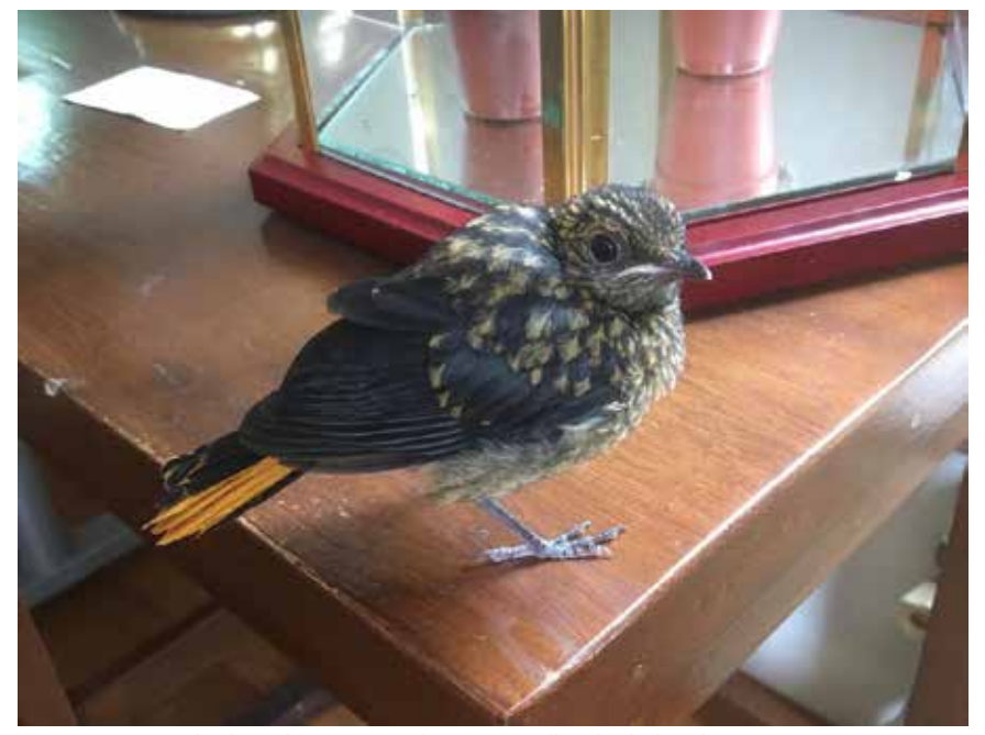
Snowy-crowned robin-chats ( Cossypha niveicapilla ) chick day thirty.