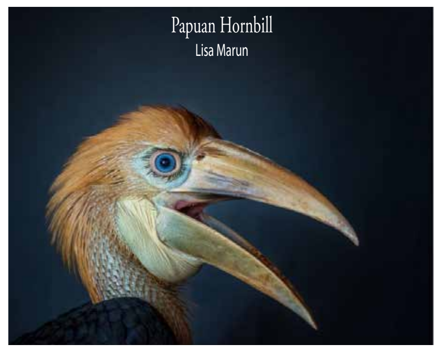
Papuan hornbill (Rhyticeros plicatus) male, two months old.

A Papuan hornbill (Rhyticeros plicatus) really does need a lot of room to spread its wings. These birds' wings are made for an impressive—and surprisingly audible—flight, with a wingspan of around 60 inches that will delight the eyes and ears of anyone lucky enough to see one in motion. Even standing still, Papuan hornbills are on the larger end of the hornbill species size range (measuring about three feet as adults).