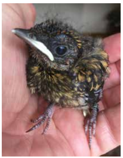
Snowy-crowned robin-chats ( Cossypha niveicapilla ) chick day 11

closed ring. Within two weeks, he left the nest, and at 13 days, he was already on a perch roosting! At three weeks, he independently ate both live buffalo and white mealworms! Incredibly fast!