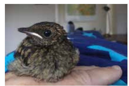
Snowy-crowned robin-chats ( Cossypha niveicapilla) chick day twenty.