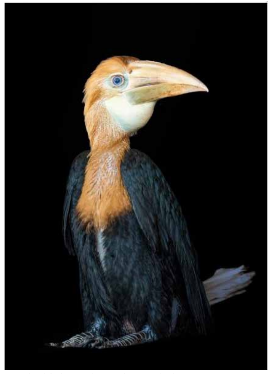
Papuan hornbill (Rhyticeros plicatus) male, nine weeks.

Also, while immature birds' eyes range from a blue to a gray-brown depending on subspecies, adult