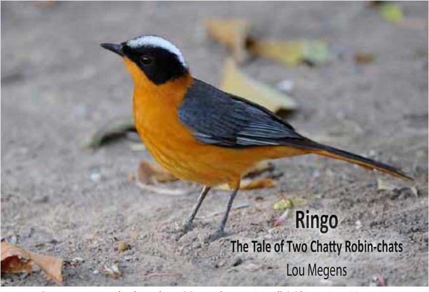
Snowy-crowned robin-chats (Cossypha niveicapilla)

Only two years ago, I described the (unplanned) hand rearing of a white-browed robin-chat ( Cossypha heuglini ), or Heuglin's robin, in detail for you. From the hatching of a damaged egg in an incubator to a beautiful free-flying bird in our living room, that was Dodo's story. Now this is Ringo's story.