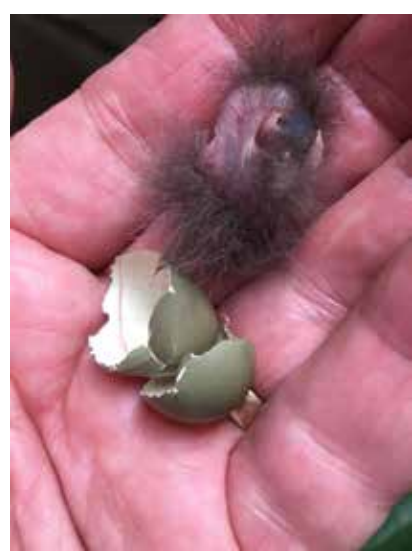
Snowy-crowned robin-chats (Cossypha niveicapilla) chick day zero.

With perseverence, I did my best to try to make this chick's survival a success story. For the first five days, I fed it <u>NutriBird A19 High Energy</u> paste. It contains the probiotics and enzymes that are absolutely necessary for young birds in their