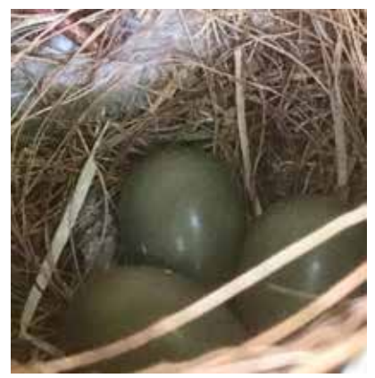
Snowy-crowned robin-chats ( Cossypha niveicapilla ) eggs.

were cold as stone! I was really convinced that life was no longer possible and opened one egg to see at what stage the embryo had died. A nearly fully grown embryo with a small outer yolk sac lay in the palm of my hand. Probably because of the contact with my body heat, I saw a slight movement!