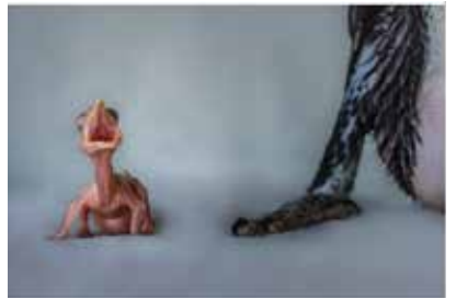
Papuan hornbill ( Rhyticeros plicatus ) seven weeks and six-day-old.

On the whole, R. plicatus are on the IUCN's Least Concern list, with most subspecies thriving within the lowland primary and secondary forests of their native lands. Despite some hunting pressure due to tribal groups' culturally-based use of the birds' feathers and bills, the Papuan hornbill is securely maintaining healthy population numbers.