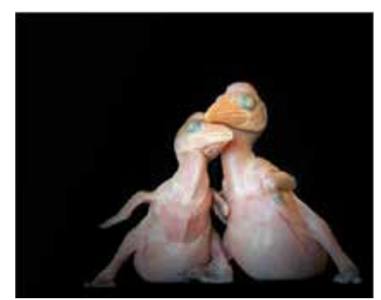
Papuan hornbill ( Rhyticeros plicatus) 12 and 14 days old.

Edward Blyth also authored The natural history of the Cranes (1881) and edited the 1840 English edition of Georges Cuvier's Animal Kingdom "Mammalia, Birds, and Reptiles" section. He identified dozens of previously unknown species of reptiles and amphibians—three of these bear his name, as well as twelve avian species, including Blyth's hornbill.