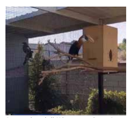
Papuan hornbill ( Rhyticeros plicatus ) male, 30 years, and nest box.

Steve houses his pair of R. p. ruficollis in an aviary approximately 30 feet by 15 feet and 10 feet high. A plywood nest box is provided that is about 20 square inches on the bottom and top and 36 inches high. As the nest box should be set near the top of the enclosure, this one is set about two feet from the top, with the bottom of it being five feet up off the ground.