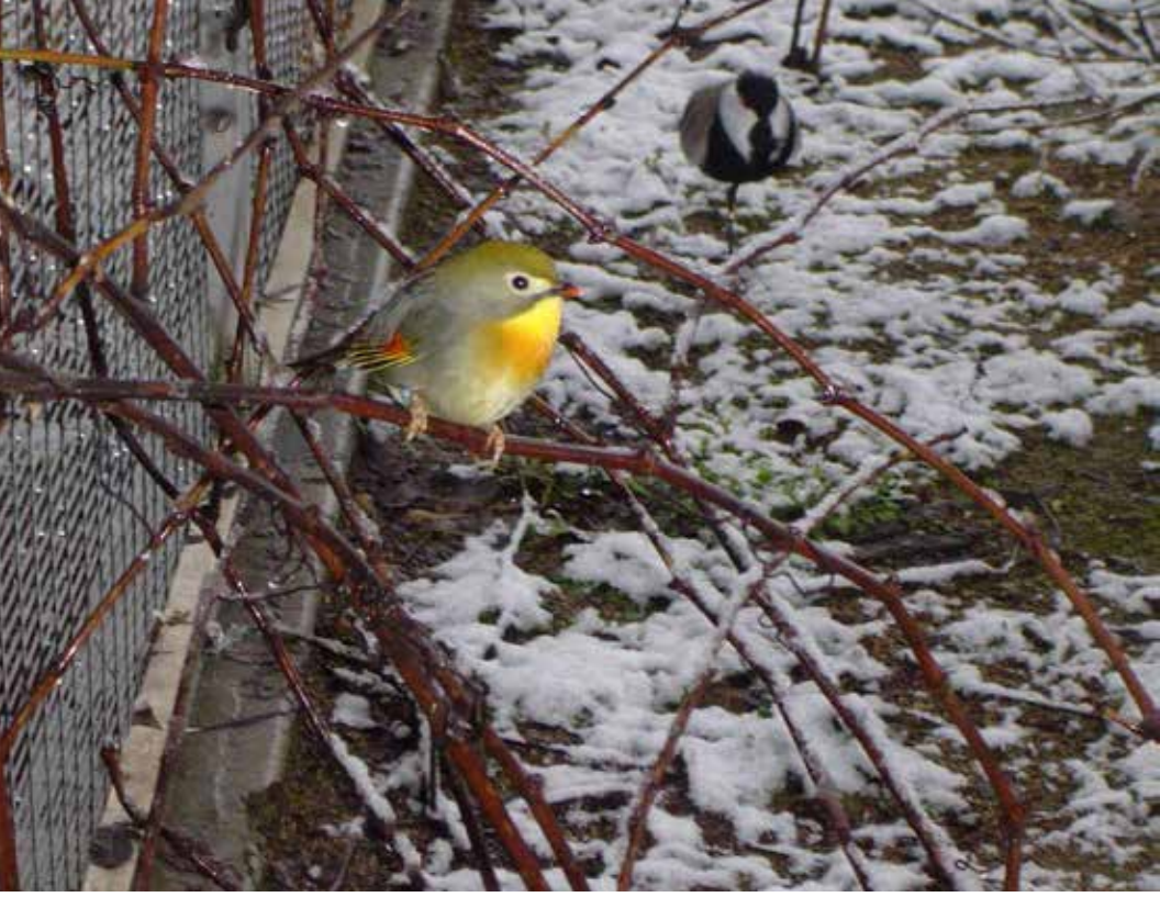
SNOW IN FLIGHTS CAN MAKE PROBLEMS. HERE A PEKIN ROBIN AND A SPURWING PLOVER DEAL WITH A LIGHT DUSTING.

Actually, most birds in aviculture can take a range of temperatures. In the wild, it is natural for them to deal with changes in temps within a 24 hour period as well as seasonal changes. Birds that are kept at constant temperatures throughout their lives are typically not as hardy as birds that are allowed to experience variations, so weather changes can be beneficial.